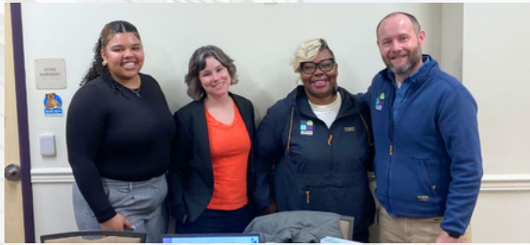
-BRHP staff at the City of Baltimore's Federal to Future Career Transition Expo

We are always seeking new talent to add to our dynamic team, and are looking for the listed opportunities: