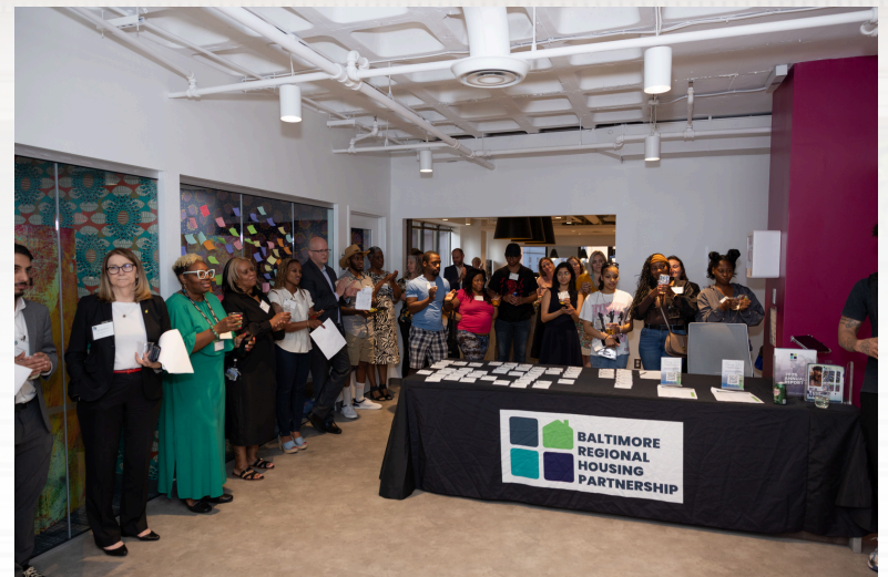
Photos include Governor Wes Moore with BRHP staff, coalition partners, participants, and advocates at the Annapolis bill signing ceremony and the celebration for the passage of HB 315/SB 335