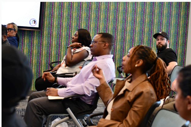
Property Partners at the BRHP office asking questions during the Q&A portion of the Property Partner Orientation

On April 15, we welcomed over 20 new Property Partners to the BRHP office to learn about the Baltimore Housing Mobility Program and explore how we partner to provide quality housing and support for our participants. When rental providers partner with BRHP, they help advance our mission to provide safe, stable, and affordable housing for families. If you have a rental property in an opportunity neighborhood that you are seeking to lease, please let us know by completing this unit listing form.